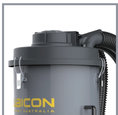
Jet pulse filter cleaning