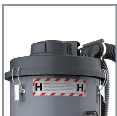
Jet pulse filter cleaning